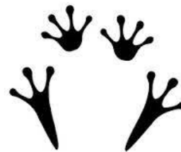
Frog leg template